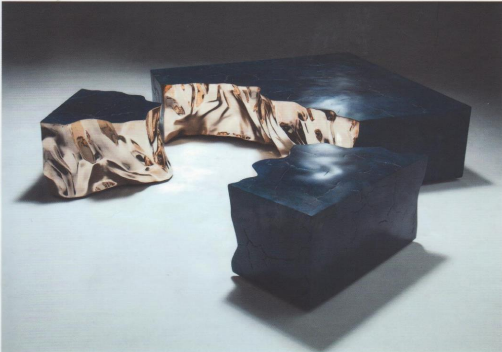
Maison Gerard at Collective Design