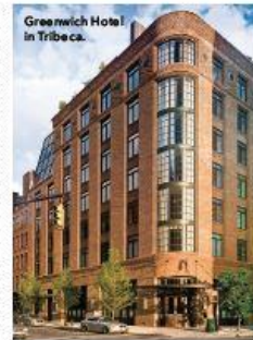
Greenwich Hotel in Tribeca. 64th St., 212-606-4600; plaza-athene.com

After a $268 million facelift, the charming hotel feels a touch more couture, and the suites have a distinctly residential feel (in line with the townhouse-lined street). INSIDER TIP: After the recent revitalization, try to book one of the six new guest rooms and eight new suites. 37 E.