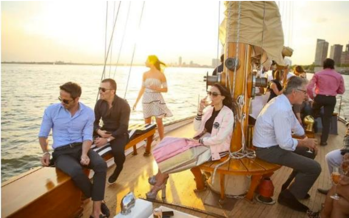
Cocktails and Canapes by Jean Georges Vongerichten are served on The Mark’s sailboat

Only snag is you will also need to be a guest at the city’s most “boldy lavish” hotel to book a trip on this classic American yacht built in 1921. She features a mahogany hull and Indian teak decks with interiors to match her namesake, by design master Jacques Grange.