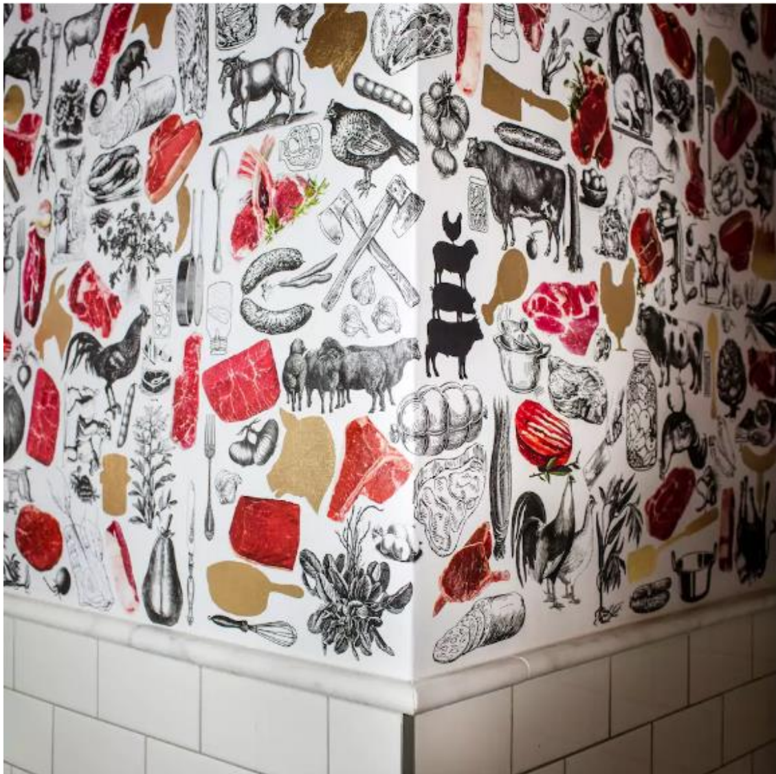
White Gold butchers in downtown New York

In a city where everyone used to eat out and there were hardly any decent butchers, a whole new guard of domestic meat purveyors have sprung up, such as Hudson & Charles on the Upper West Side and Honest Chops downtown, where Wall Street types queue up for the best lamb shoulder cuts (lamb is hot by the way, after years of lumbering around in a meaty wilderness).