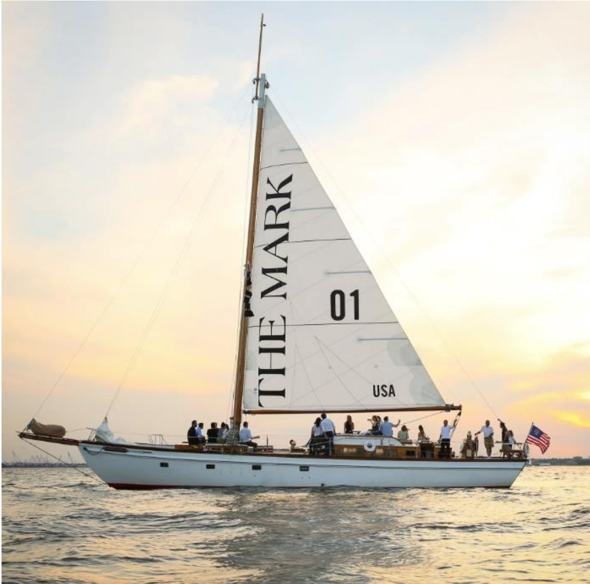
The Mark Hotel's sailboat will soon be setting sail for the season from Tribeca's North Cove Marina